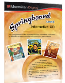
Levels 17–23 21 eBooks on CD 9781420282108