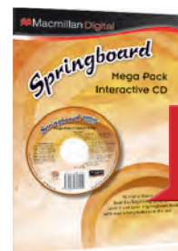
Interactive Mega CD Levels 1–30 90 eBooks 9781420286199