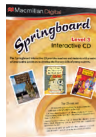
Levels 24–30 21 eBooks on CD 9781420282115