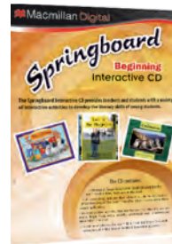
Levels 1–8 24 eBooks on CD 9781420282085